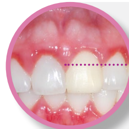
Stage 1 Gingivitis