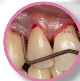
Stage 3 Advanced Periodontitis